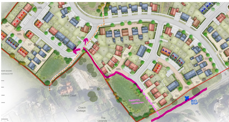
Annotated map for illustration only.

If minded for approval, we would suggest the following conditions for your consideration.